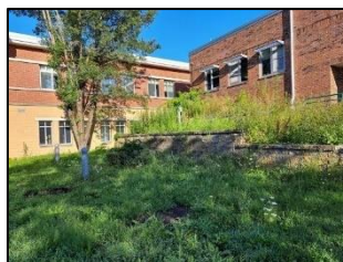
Courtyard Gardens – Before