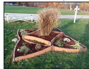
Refurbished Track-side Garden