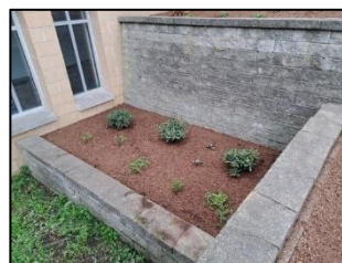
Courtyard Gardens – After