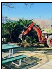
Overgrown Bush Removal Before