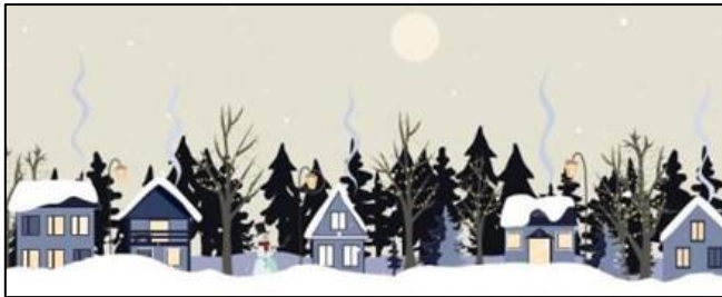
(Sponsored by the Friends of the Salem Library)

Register at the circulator desk beginning January 22, 2024 to receive your reading log. Read as much or as little as you would like! Turn in your reading log by March 4, 2024 to receive a raffle ticket (1) and a free book of your choice.